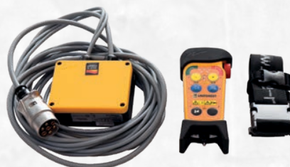
Tele Radio T-70-1