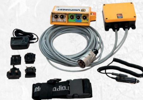
Tele Radio T-80-1