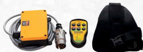
Tele Radio T-60-UF