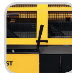
Saw activation handle.