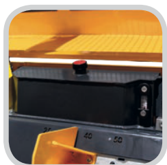
Oil tank for automatic chain lubrication with an oil level indicator.