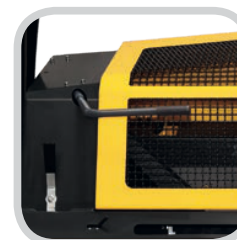
Log stabilizer handle.