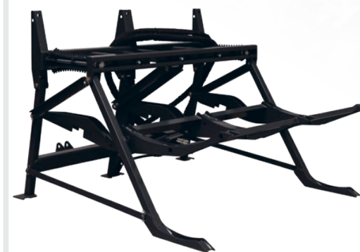
For easier work, the LT650 lifting table with a width of 1700 mm can be mounted in the front.