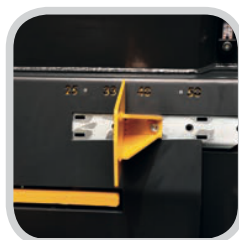
Splitting length 25, 33, 40 or 50 cm.