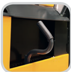
Splitting knife height adjustment handle.