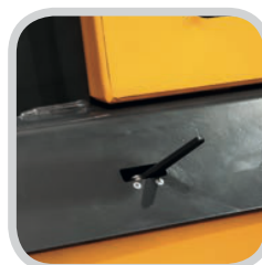
Handle for optional deactivation of log retaining plate.