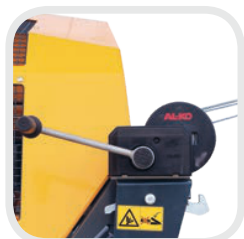
Mechanical winch for adjusting conveyor height.