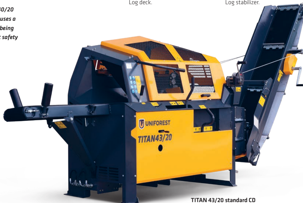
TITAN 43/20 standard CD