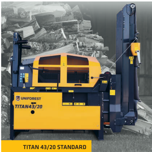
TITAN 43/20 STANDARD