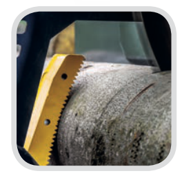
Hydraulic clamp holds log during cutting.