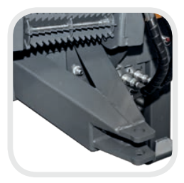
Towing hitch for linkage tool bar (draw bar optional).