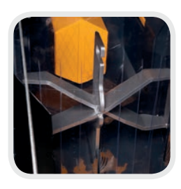
Hydraulically adjustable height of the splitting knife 2-4, 2-6, 2-8, 2-12.