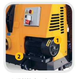
1. 15 kW electric motor. 2. Category II and III linkage.