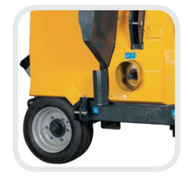
Axle kit - 200/60/R14.5 wheels.