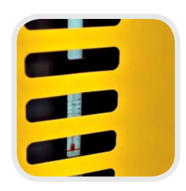
Temperature and oil level indicators.