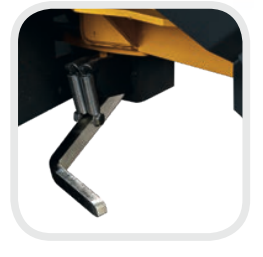
Conveyor belt adjusting position L/R ±15°.