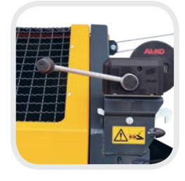
Mechanical winch for adjusting conveyor height.