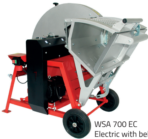
WSA 700 EC Electric with belt drive