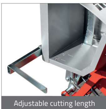
Adjustable cutting length