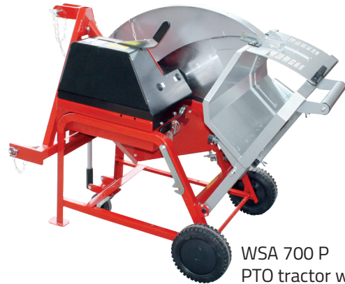
WSA 700 P PTO tractor with belt drive