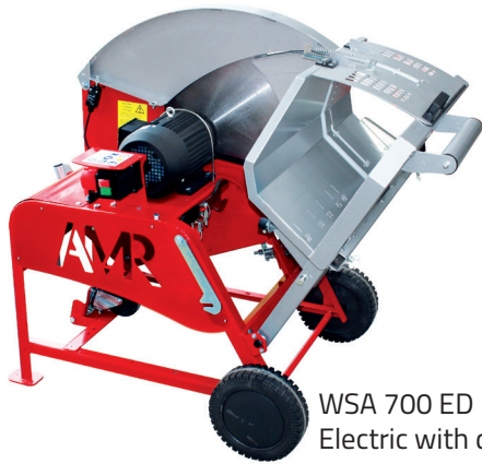
WSA 700 ED Electric with direct drive