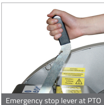
Emergency stop lever at PTO