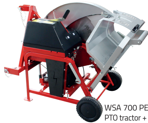
WSA 700 PE PTO tractor + Electric with belt drive