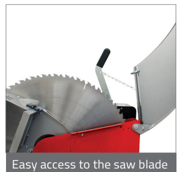
Easy access to the saw blade