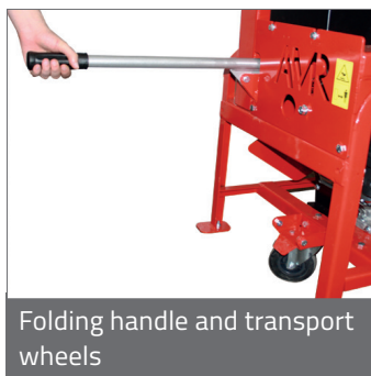
Folding handle and transport wheels