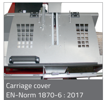
Carriage cover EN-Norm 1870-6 : 2017