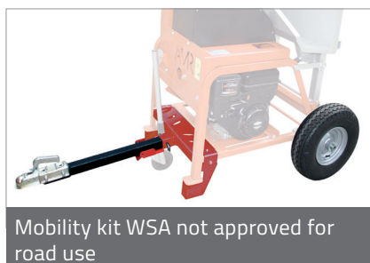
Mobility kit WSA not approved for road use