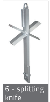
6 - splitting knife